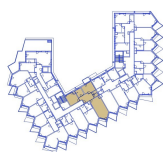
schéma umístění bytu