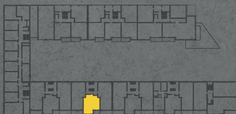
umístění bytu na 1. np