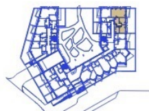
SCHEMA UMÍSTĚNÍ BYTU