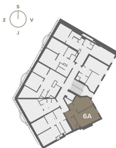
Půdorys podlaží Umístění bytu na patře