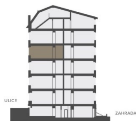
Řez domem Pozice bytu v rámci domu